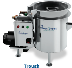
Trough Model PRT