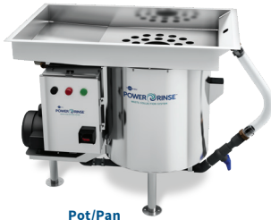
Pot/Pan Model PRP