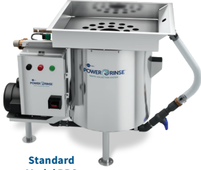
Standard Model PRS